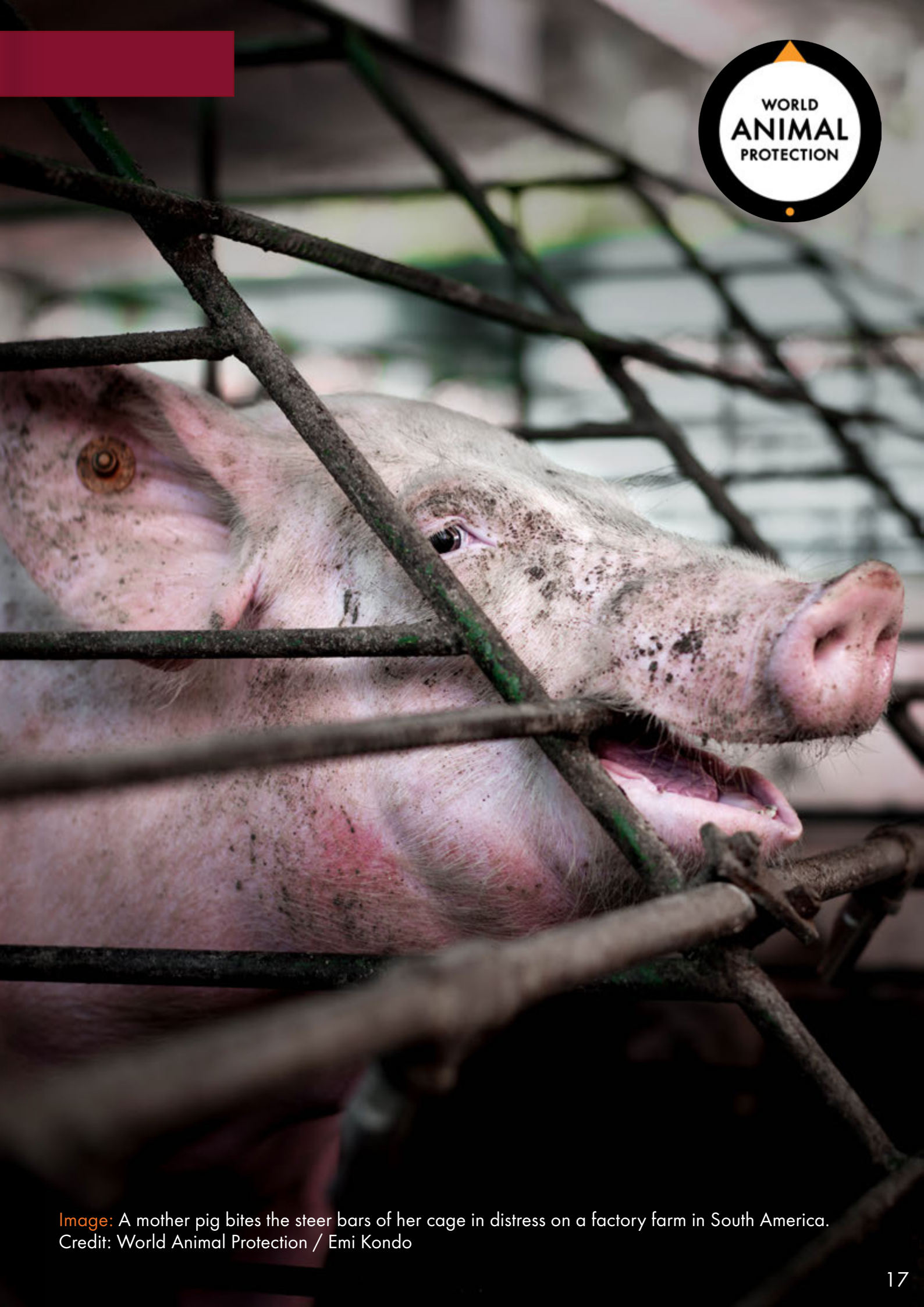
Image: A mother pig bites the steel bars of her cage in distress on a factory farm in South America.