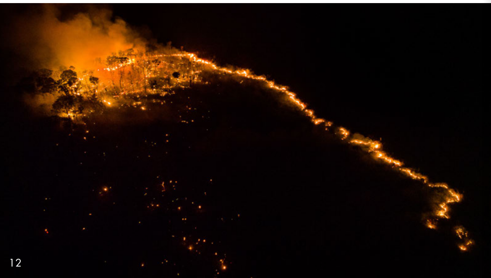
Image: Fire is used to clear land to grow animal feed crops, decimating wildlife habitat and exacerbating climate change. Fire in Nova Mutum municipality, Brasil.

And it’s not just JBS. All global factory farming giants must reduce the amount of meat they produce, and instead embrace humane and sustainable plant-based food. This is for the sake of people, animals and our climate crisis.