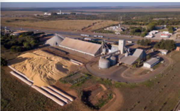
Images: Aerial view of corn silos at Tangará da Serra, Mato Grosso, Brazil

And the examination of the boundaries of the properties of farmer Y showed there was evidence of insufficient land authorised to grow grain to meet the terms of the contract. This suggests the grain must have come from elsewhere – most likely from prohibited areas – and this lack of contract specificity facilitates grain laundering.