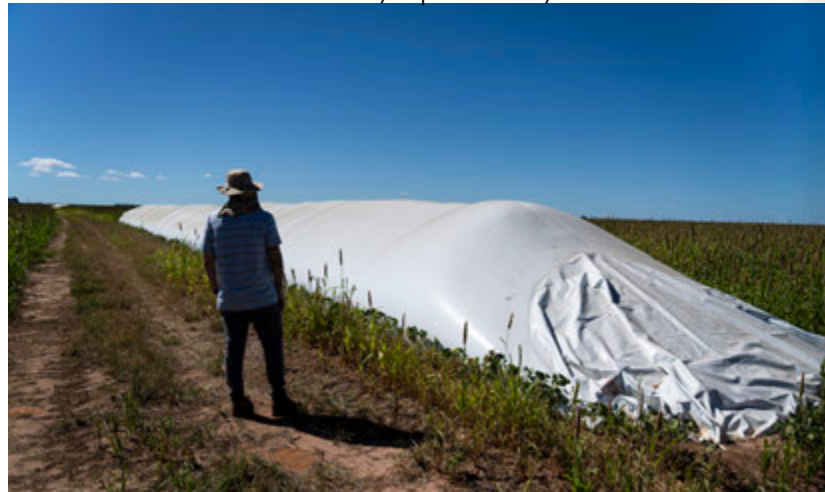
Image: Farmer Y property - Silo plastic bags are used to store crops.

Like Farmer X, Farmer Y is a large-scale farmer in the Cerrado ecosystem. He and his family have been fined multiple times over the past five years for illegally clearing land and growing crops in prohibited areas. And despite a 2018 ban to stop Farmer Y from growing grain on more than 2,500 hectares, authorities discovered he had violated this in 2020 and as recently as 2022.