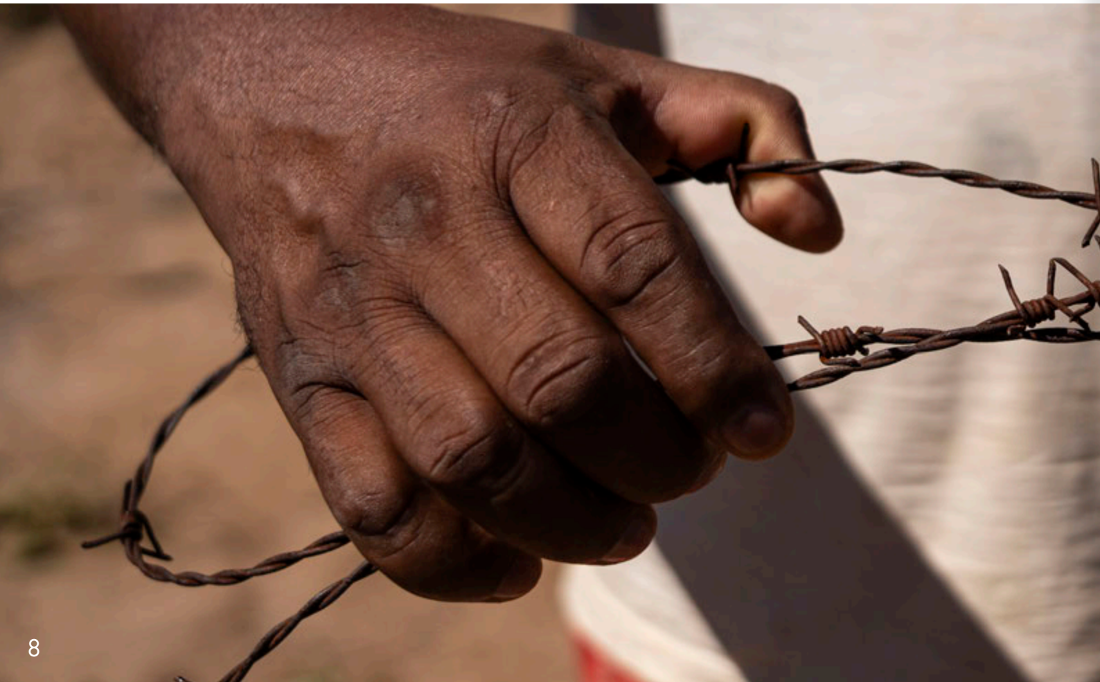
Image: A traditional small scale farmer finds his wire fence has been cut.

A new World Animal Protection investigation with Repórter Brasil, reveals JBS links with Farmer X who registered neighbouring traditional community land in the threatened Cerrado as his own. Farmer X is a powerful farmer who owns three farms in the region totaling 12,500 hectares.