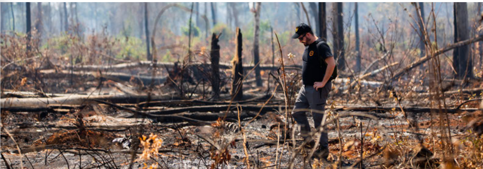
Image: World Animal Protection and local partner, GRAD, monitor the impact of fires on wildlife and help injured animals in Nova Ubirata municipality, Brazil.

And this is not only about Brazil. Factory farming continues to spread across our planet. Increased demand for meat and animal feed drives what happens on the frontlines of habitat destruction.