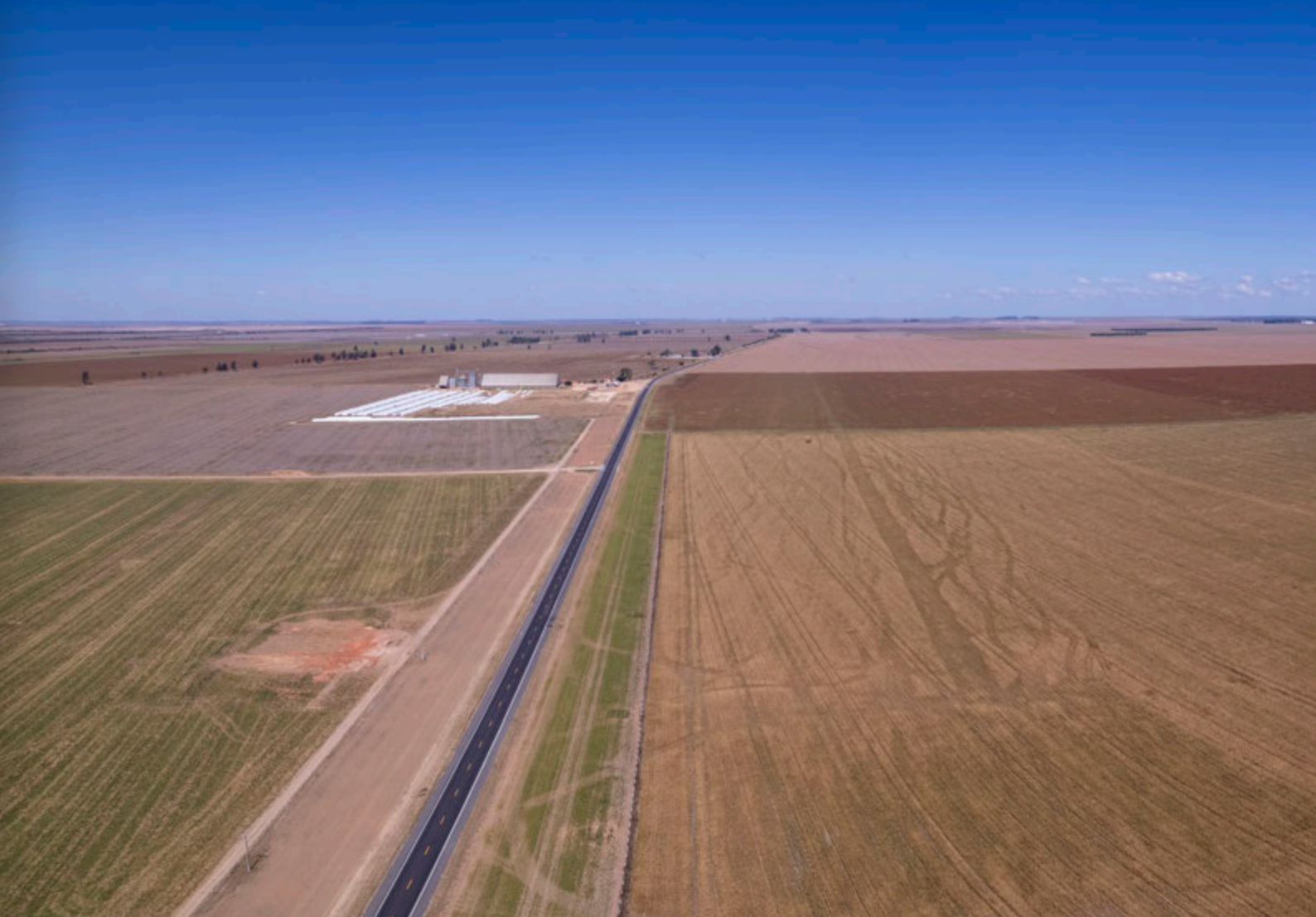
Image: Farmer X property – Crops are planted to feed animals on factory farms.

And the examination of the boundaries of the properties of farmer Y showed there was evidence of insufficient land authorised to grow grain to meet the terms of the contract. This suggests the grain must have come from elsewhere – most likely from prohibited areas – and this lack of contract specificity facilitates grain laundering.