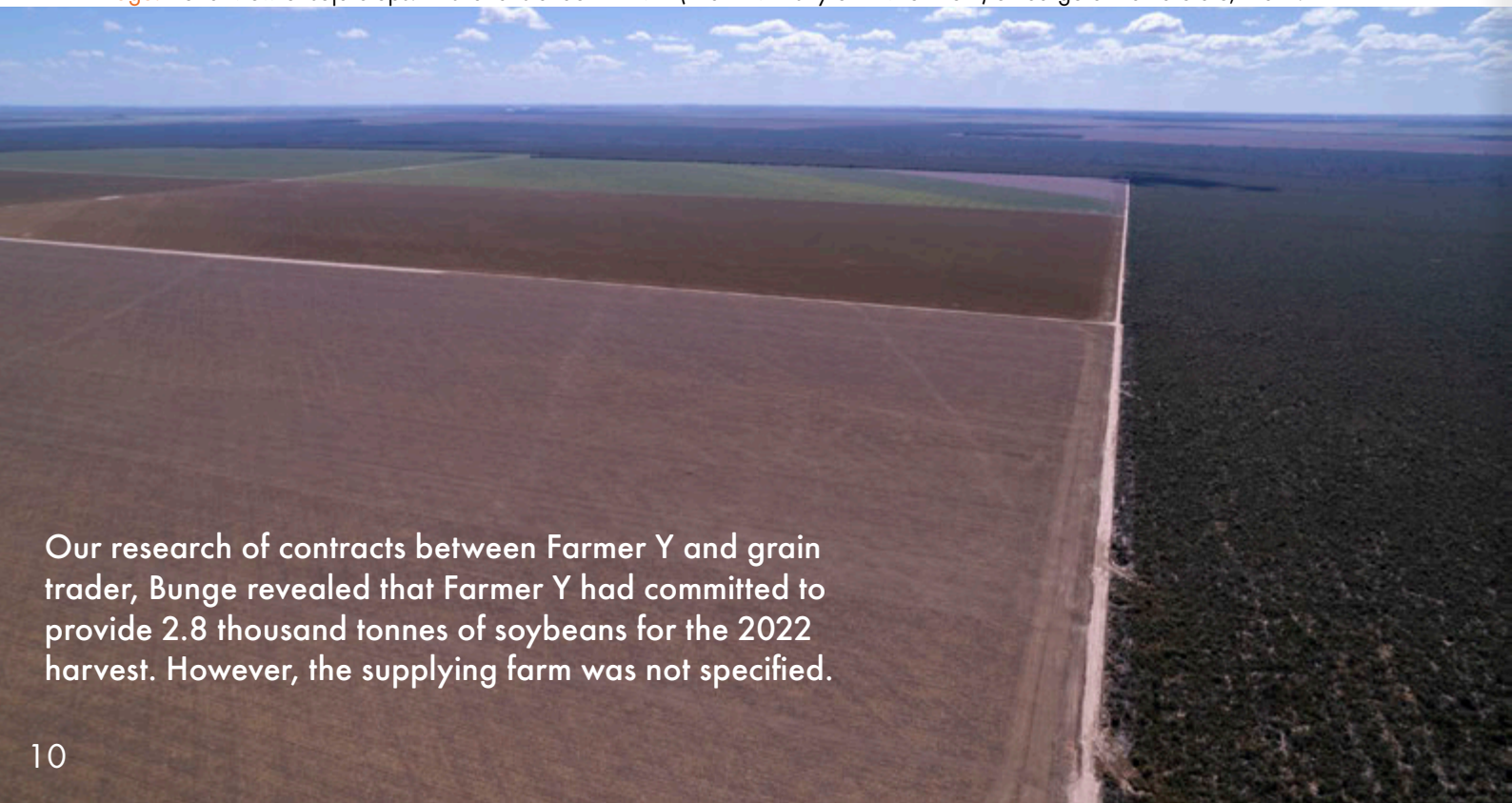
Image: Aerial view of soja crops. This land is under IBAMA (Brazil Ministry of Environment) embargo at Bahia State, Brazil.

Our research of contracts between Farmer Y and grain trader, Bunge revealed that Farmer Y had committed to provide 2.8 thousand tonnes of soybeans for the 2022 harvest. However, the supplying farm was not specified.