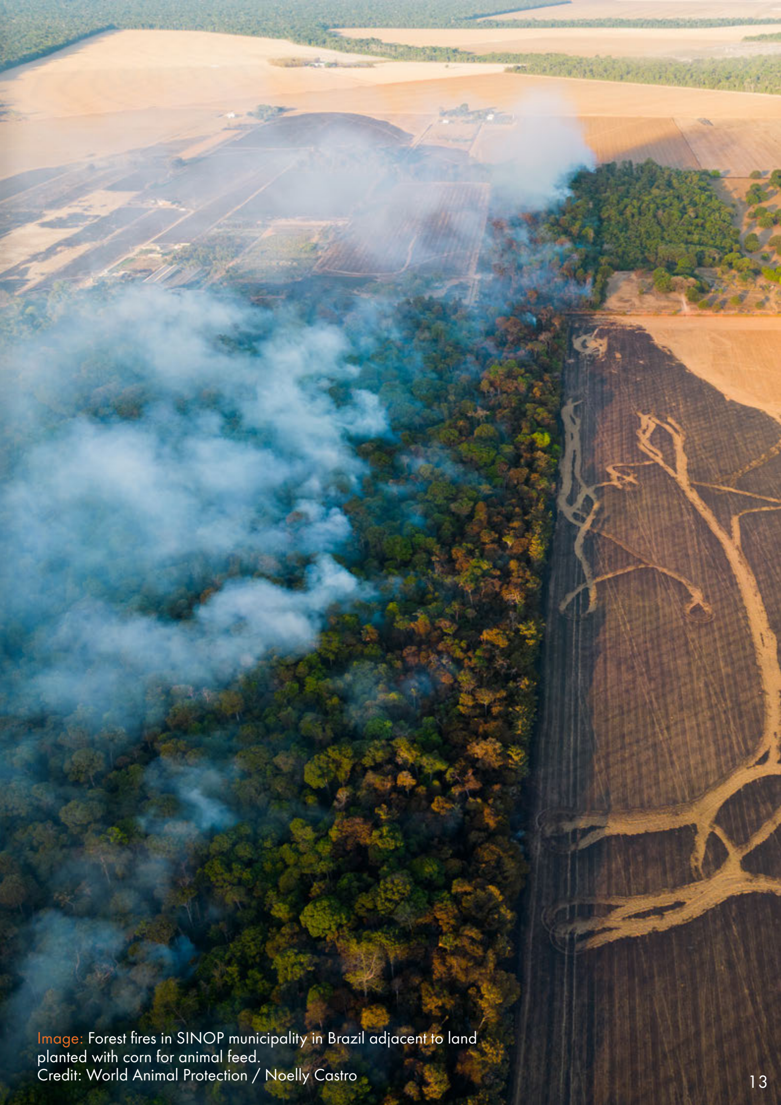
Image: Forest fires in SINOP municipality in Brazil adjacent to land planted with corn for animal feed.