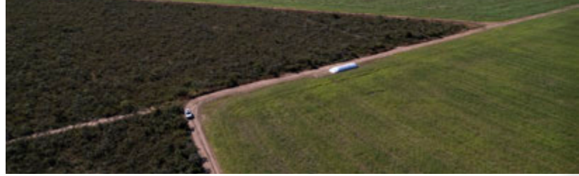
Image: Farmer Y property - Aerial view of crops planted to feed animals on factory farms.

Bunge - a JBS soy supplier - bought animal feed crops from Farmer Y who disguised its illegal origins. This was revealed in the farmer and crop purchaser contract which showed a much higher volume of crops than would ordinarily be possible to grow on the farmer's legal lands.