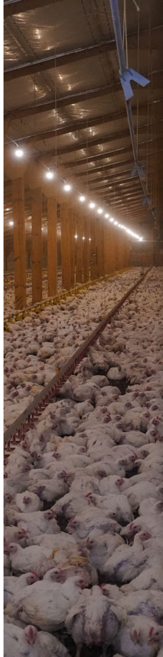
Image: A global trade in animal feed underwrites factory farmed meat production around the world. Pictured: UK farm.

World Animal Protection head of animals in farming campaign